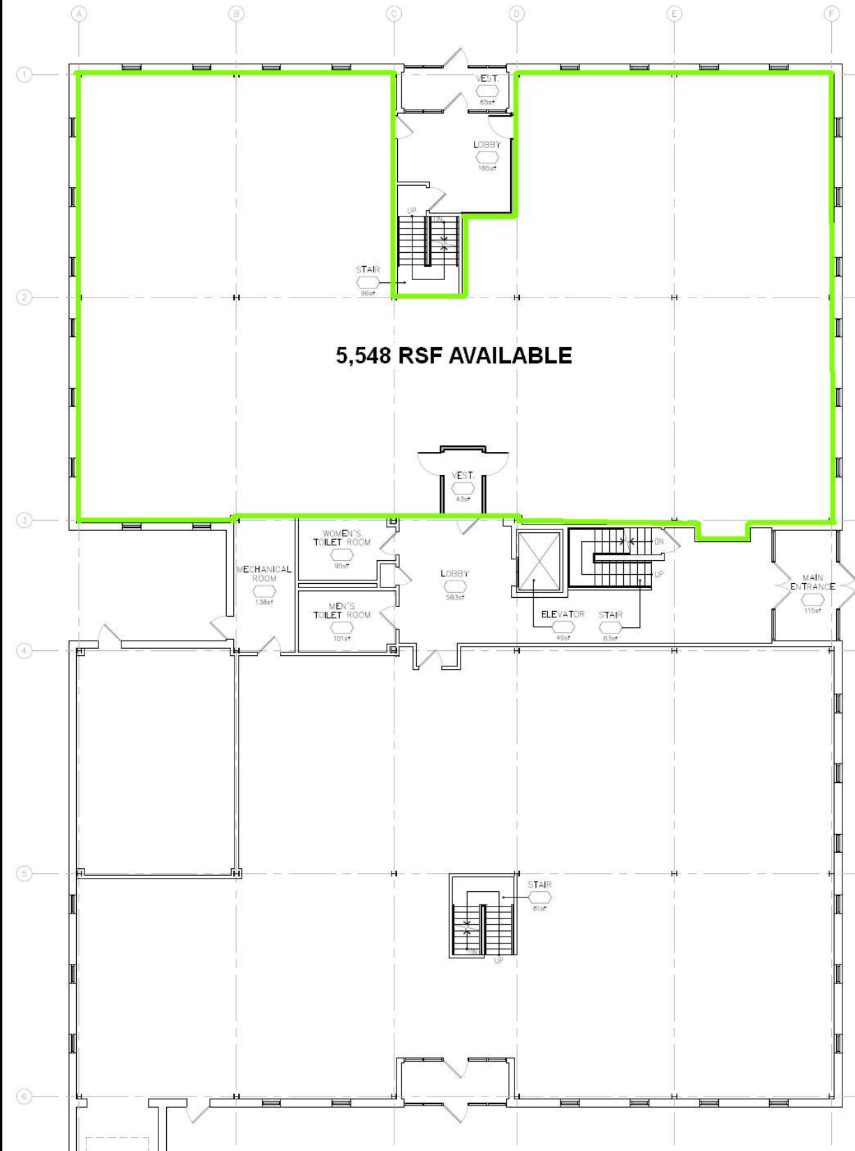
1 FIRST FLOOR LEASING PLAN